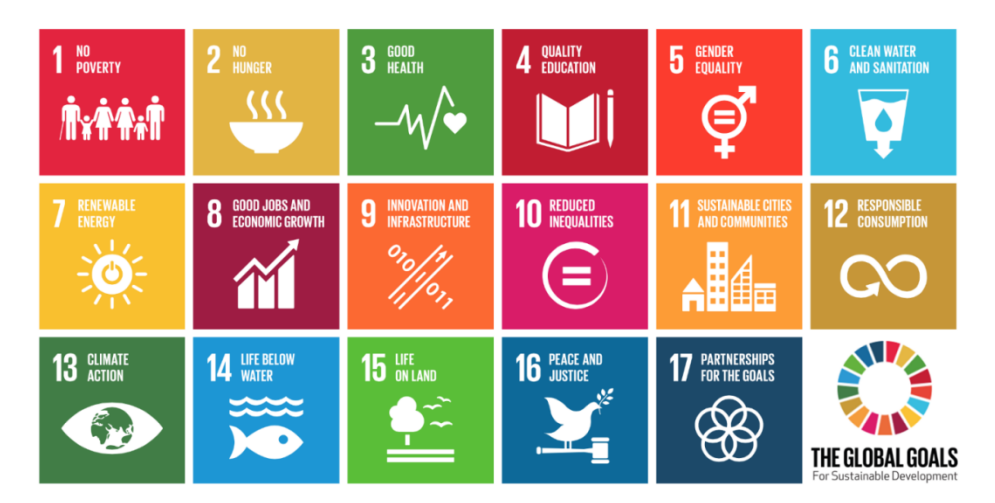
Figure 02 – 17 Global Goals For Sustainable Development. (Source: UN, 2015).

Therefore, the internationalization of higher education should not be seen as an end in itself, but as a vector for changes and improvements in the development and production of knowledge that privileges the constant dialogue between the local and the global. Diversifying the academic and technical body and expanding the possibilities of intercultural and academic exchanges are some of the challenges of this agenda.